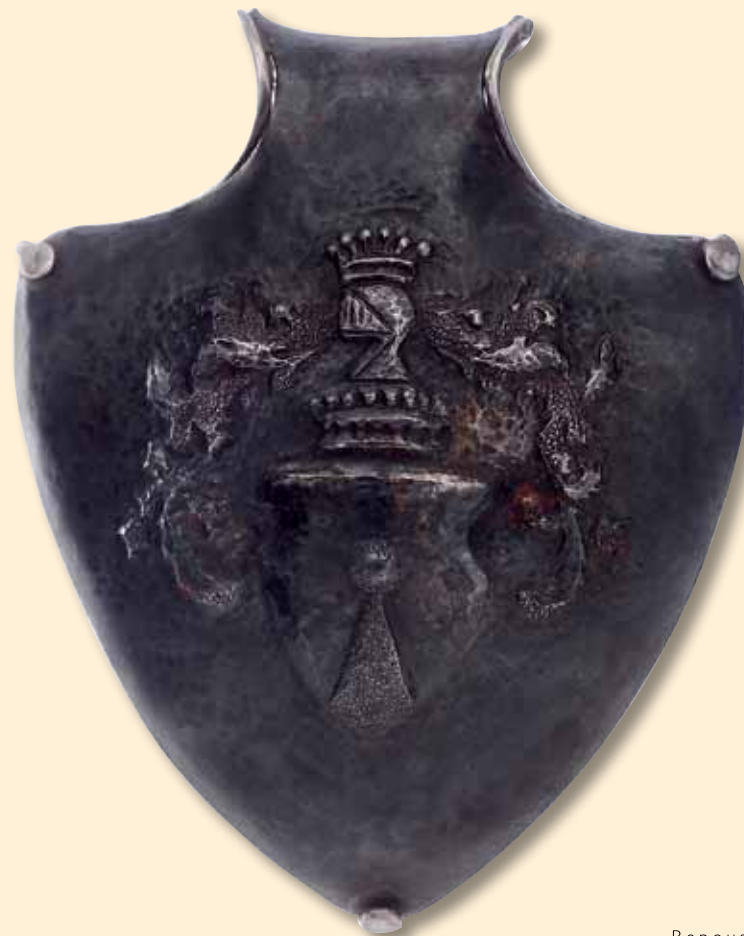
IdB™ SHIELD Repoussage forged iron. Unique piece exhibited as part of "Skin. La Superficie del Gioiello" (Skin. The Surface of the Jewel)