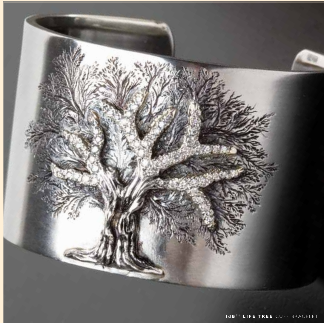
IdB™ LIFE TREE CUFF BRACELET